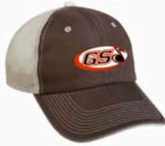
GWT-101M 6 panel, Garment Washed Cotton Twill, Structured, Mesh Back, Contrast Stitching, Pre-curved Sandwich Visor, Adjustable Velcro Closure.