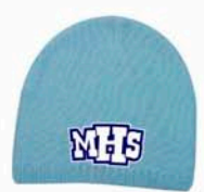
KNR-560 Cotton/Acrylic Knit Beanie, Decorative Ribbed Bottom. One Size Fits Most