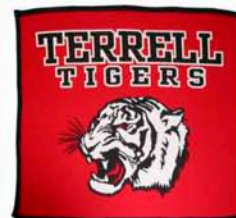
Knitted Spirit Blanket This American made blanket is one of the finest quality knitted blankets available today. Made of 100% hi-bulk acrylic yarn, the logo is "knitted in" so the blanket will permanently retain its original colors. These blankets are durable, long lasting and are machine wash and dryable. Each blanket comes in a zippered vinyl case. 63" X 63"