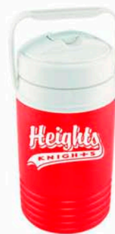
1/2 Gallon Cooler Made of durable plastic Comes with a reclosable lid Integrated handle for carrying & pouring Large imprint area

$ 10.00 qty. 36 $ 9.50 qty. 72 $ 9.00 qty. 144