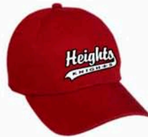
GWT-116 6 panel, Garment Washed Cotton Twill, Unstructured, Pre-curved Visor, Velcro Closure.