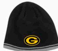
KNW-500 Cotton/Acrylic Striped Knit Beanie, Q77™ Technology, One Size Fits Most