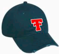
GWT-222 6 Panel Unstructured Factory Distressed Garment Washed Cotton Twill, Pre-curved Frayed Visor, Tuck Strap Closure.