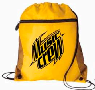
Day-pak Cinch Bag Oxford Nylon, water resistant medium weight Zippered front pocket with mesh Double drawstring cinch closure 14" x 16.5"

$ 5.00 qty. 100 $ 4.00 qty. 250 $ 3.00 qty. 500