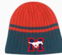
KNS-503 Cotton/Acrylic Ribbed Knit Beanie. One Size Fits Most